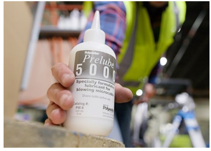
Prelube 5000 applied to duct prior to blowing fiber cable

<sup>1</sup>Griffioen, Willem Cable in Duct Installation: Lubrication Makes the Difference. Proceedings of the 61<sup>st</sup> International Wire & Cable Symposium IWCS Conference 2012. Providence RI, United States