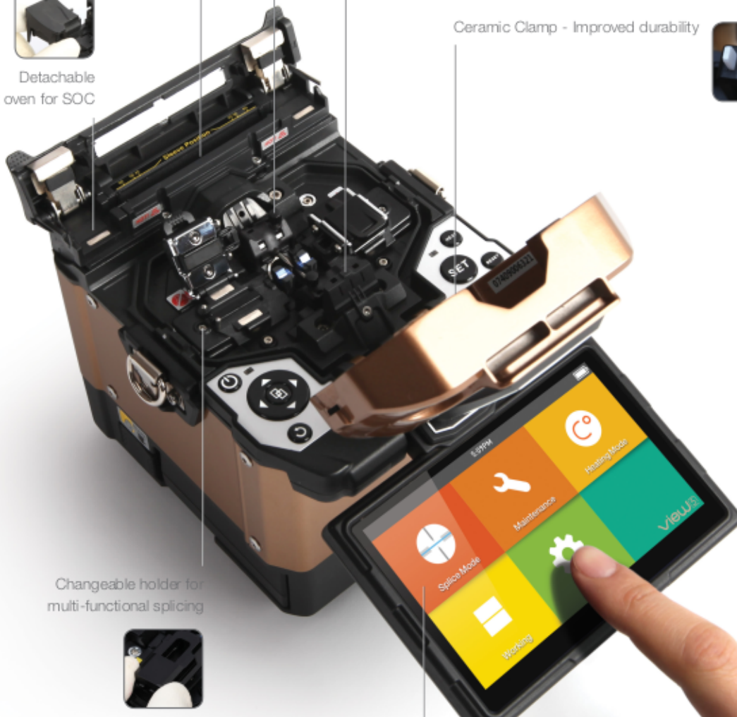
Changeable holder for multi-functional splicing