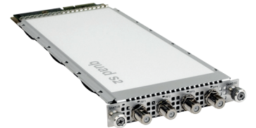
Quad DVB-S2 (S) module