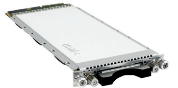
Dual DVB-C / Quad DVB-C module with Dual Common Interface module (optional) installed