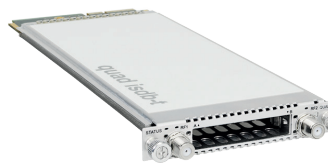
Quad ISDB-T module