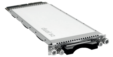
Dual DVB-S2 (S) module with Dual Common Interface module (optional) installed

Receiver models with descrambling capability are equipped with two Common Interface modules slots and two or four satellite, terrestrial or cable inputs. The Common Interface modules can be flexibly connected to either of the inputs. For example, each of the inputs can allocate own Common Interface module, or one input can use both modules for descrambling higher number of services or two different CAS system descrambling. When both descrambling slots are assigned to one input, then the other input can still be used for Free to Air services.