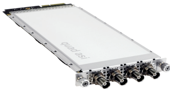
Quad DVB-ASI module