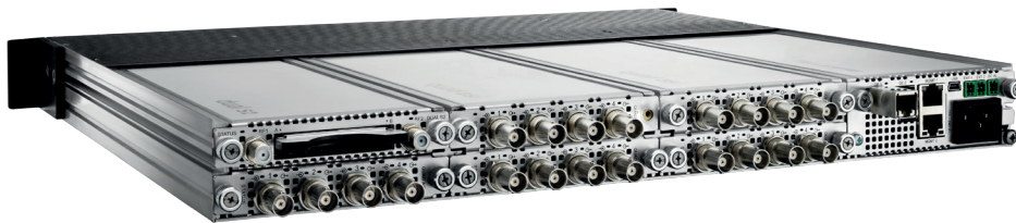
Luminato platform fully furnished with ASI modules and Dual S2 receiver module with CI