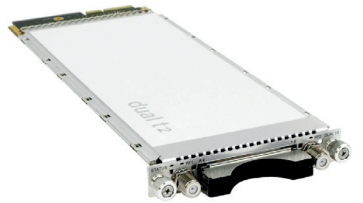
Dual DVB-T2 (T) / Quad DVB-T2 (T) module with Dual Common Interface module (optional) installed

All receiver modules have the optional capability to do DVB Common Scrambling Algorithm and AES content protection. The embedded scrambling doesn't require any additional hardware and the user can freely select which services will be scrambled. The content is never accessible in unprotected format which is highly appreciated by content providers. The component level scrambling is also supported to allow only video and audio scrambling and leave other streams untouched to avoid descrambling challenges for bursty data in set-top box.